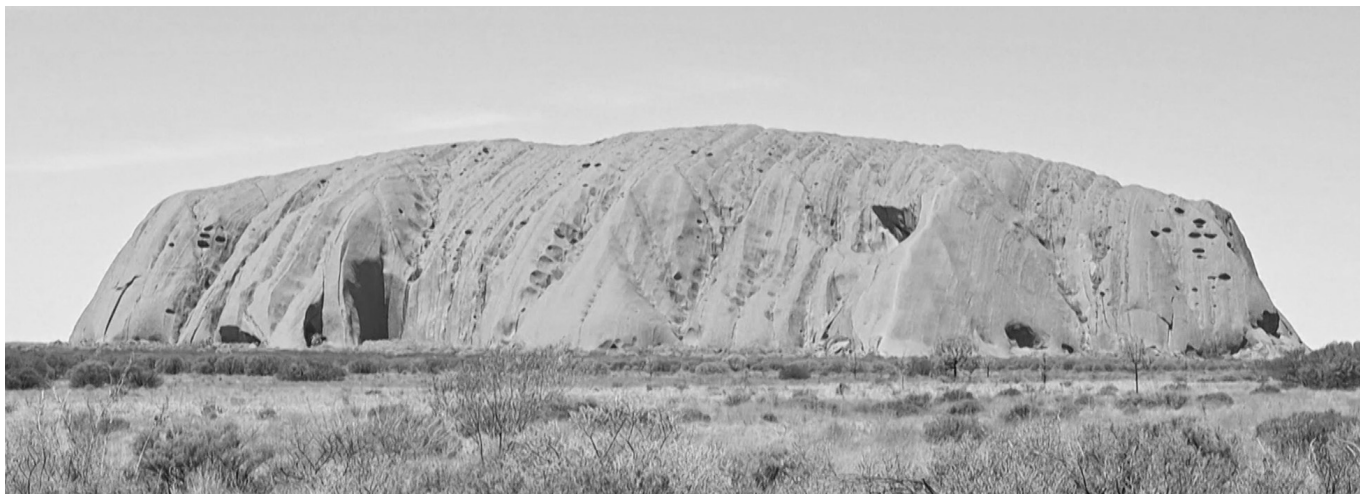
Uluru in Uluru-Kata Tjuta National Park