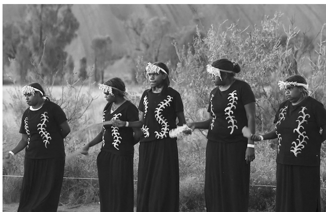
The Anangu People